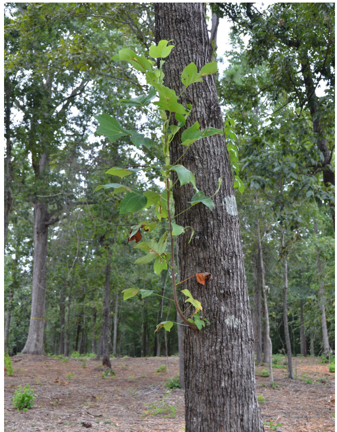
Epicormic branches. Epicormic branches often form on tree trunks after a hardwood stand is thinned. This yellow poplar sprouted an epicormic branch as a result of increased light after a recent thinning.

In abandoned crop lands or in forests where natural seedlings and small trees of desired species are not present, the planting of seedlings or seed may be needed. The most important step in planting is choosing the right species for the site. This choice can make the difference between success and total failure. For wet sites, consider nuttall oak, willow oak, or green ash. For fertile, well-drained sites, consider cherrybark