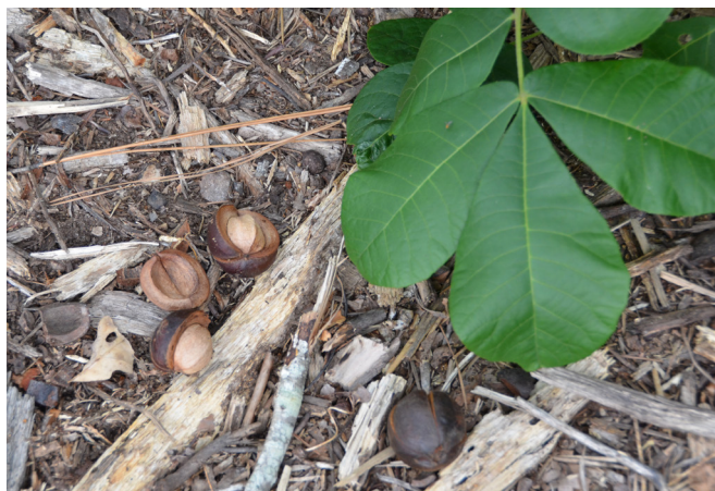
Hickory nuts. Hickory nuts have hard shells surrounded by a woody husk.

How do you determine if your forest can produce high-quality hardwood sawtimber or veneer? The presence of high-quality trees is a good indicator. However, if high-quality trees are absent, the forest may still have the potential for producing them. To determine this potential, you must consider two things: the soil and the species of trees present.