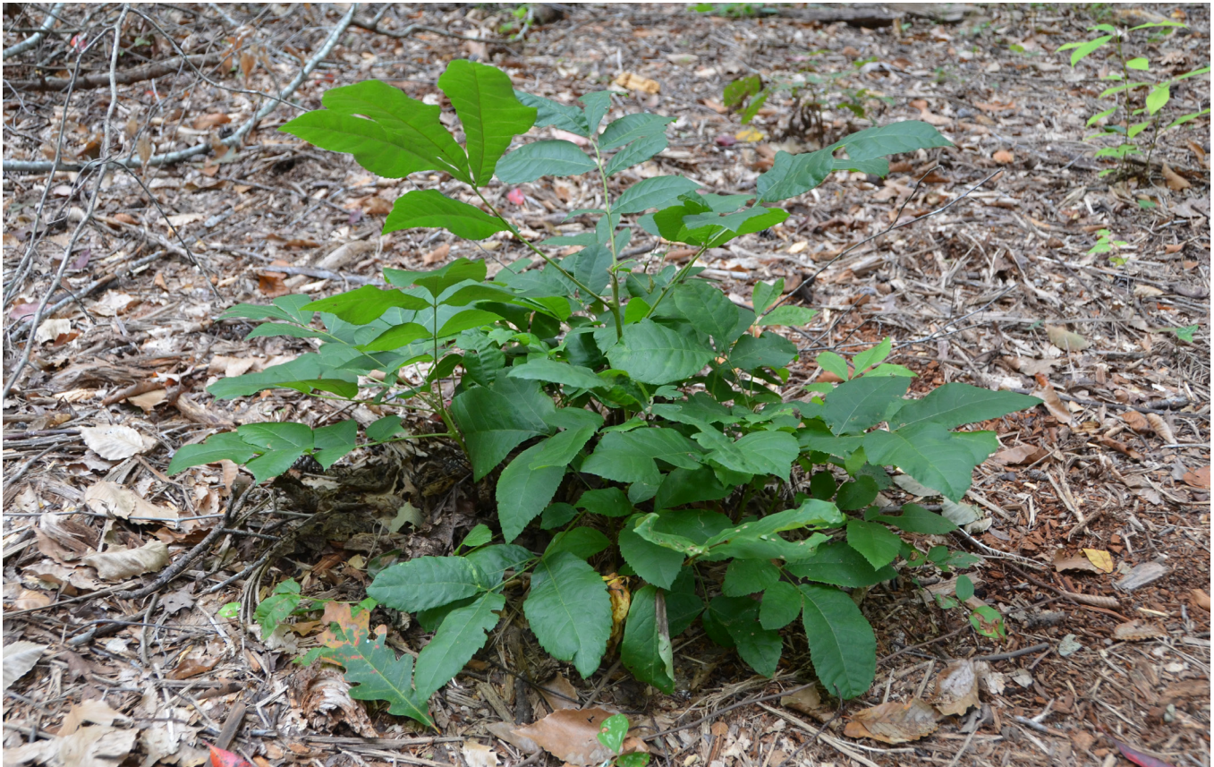
Stump sprouts. Small hardwood stumps often sprout back quickly after a timber harvest and may provide the best regeneration option for many hardwood species.