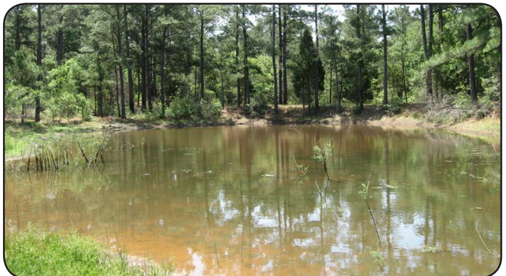
Houston toad habitat in Bastrop County.