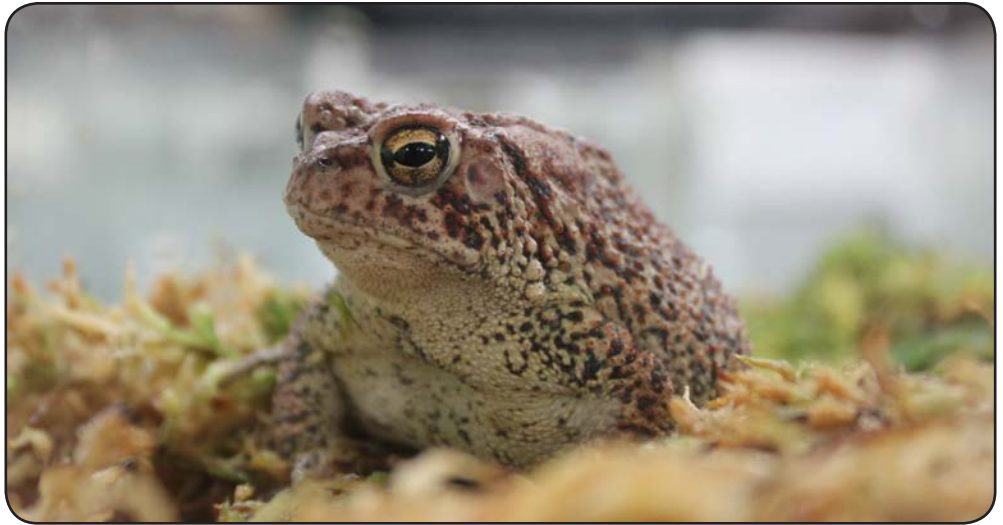
Houston toad in the Houston Zoo Captive Assurance Colony.

Non-federal landowners within Austin, Bastrop, Burleson,