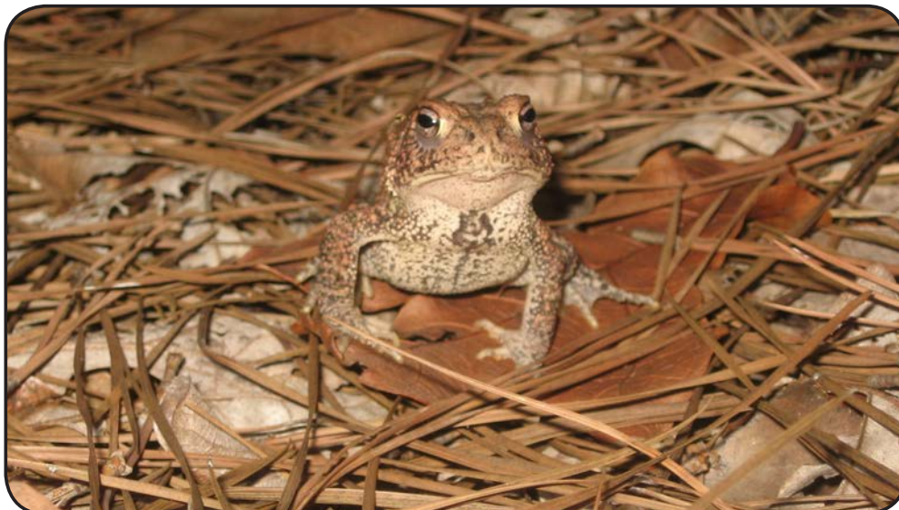
Houston toad in the wild.